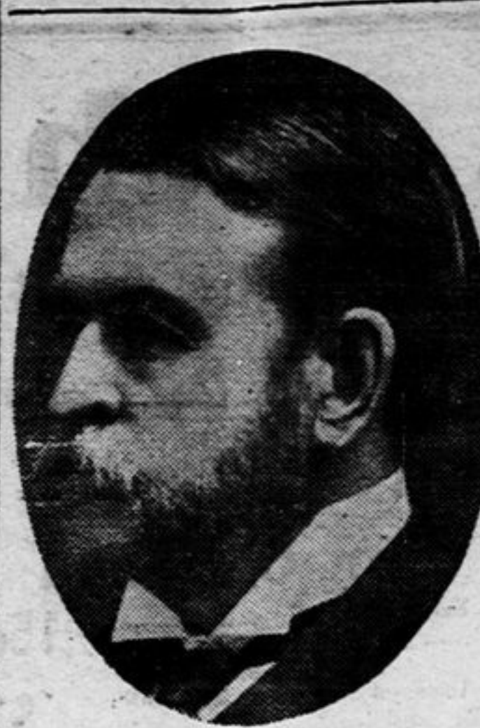
SIR JAMES WHITNEY Premier of Ontario, Who Addressed 800 People at the Academy Friday Night.