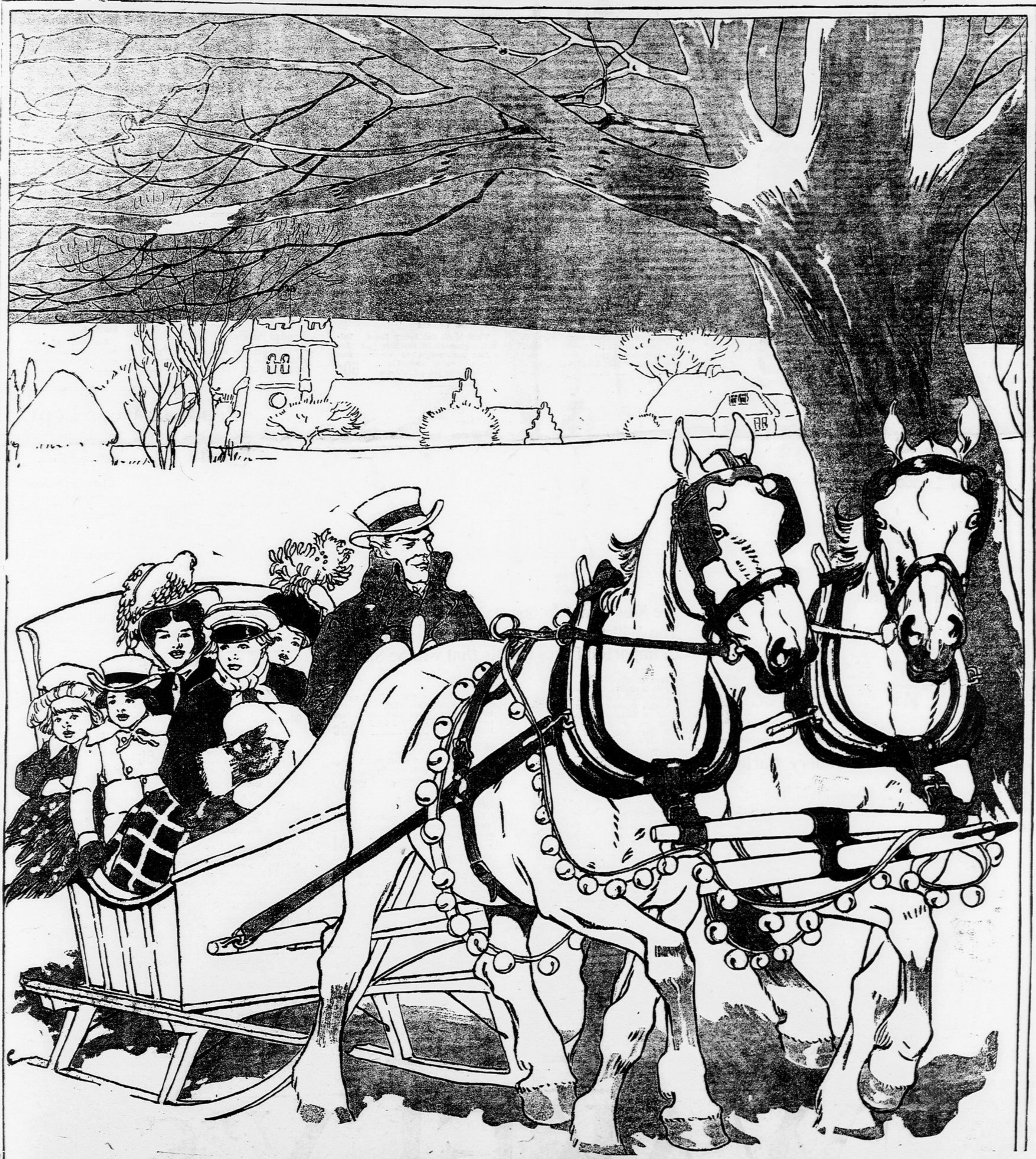
"GOING TO GRANDPA'S"