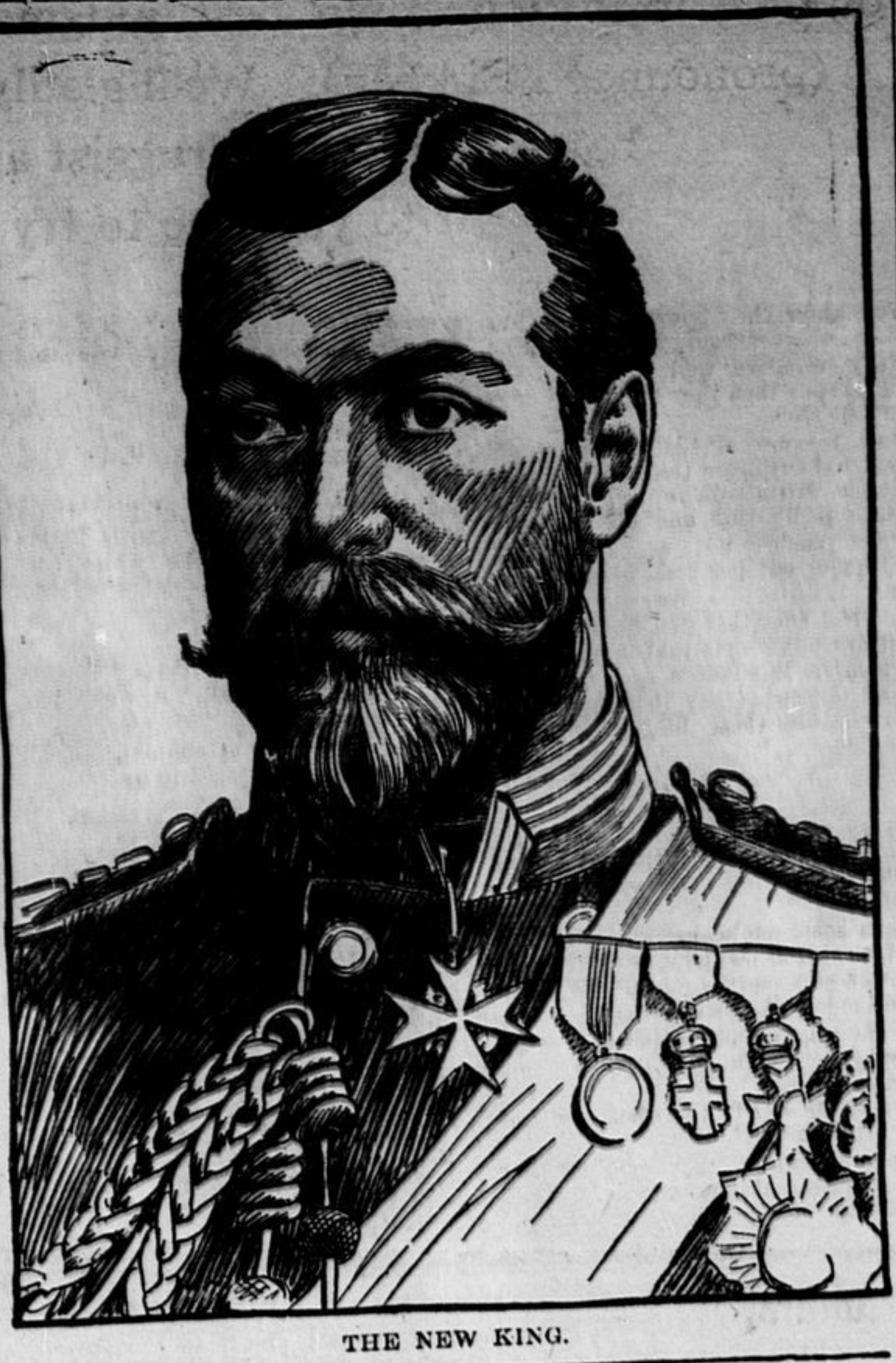
THE NEW KING.