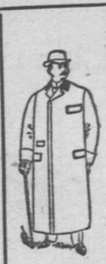
Children's, Boys and Young Men's Overcoats in the Newest Styles and Best Qualities at Moderate Prices