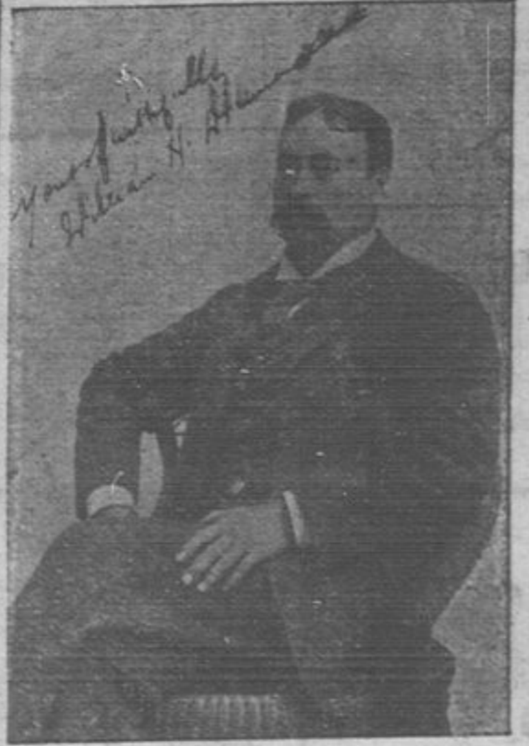
DR. W. H. DRUMMOND, The Habitant Poet "An Evening With The Habitant"