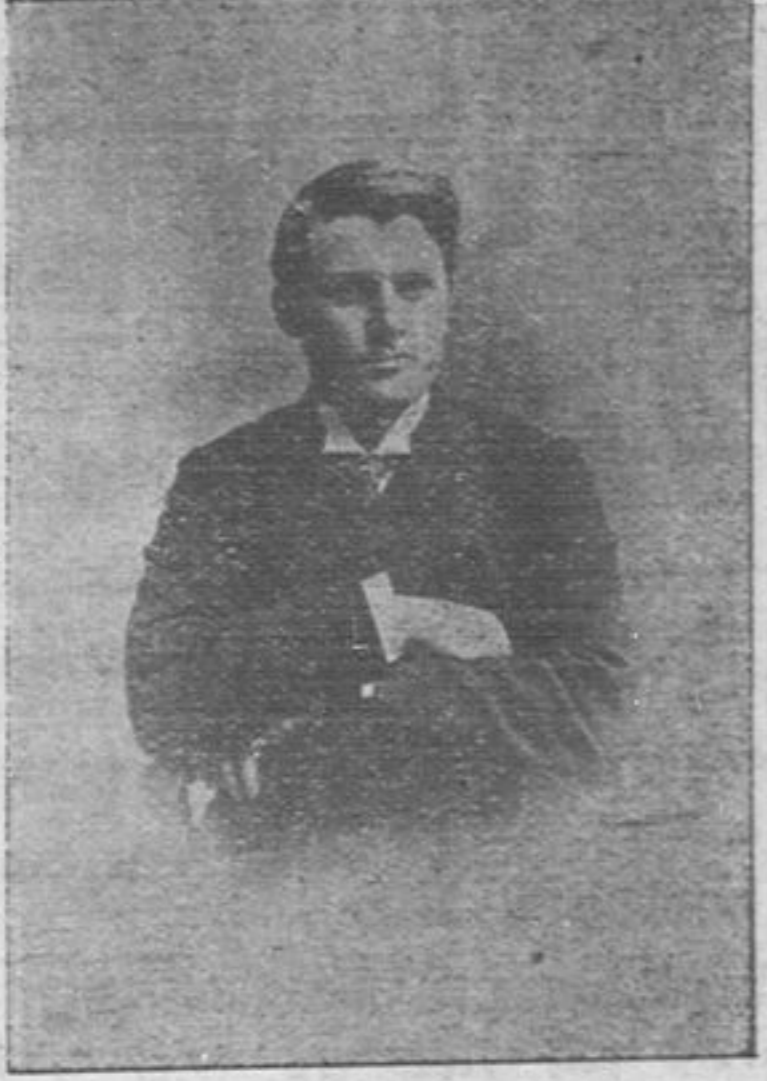
SIR CHARLES TUPPER, K.C., M.G., M. P., "Has Canada Done Her Duty to the Empire?" VARSITY GLEE CLUB CONCERT IN JANUARY.