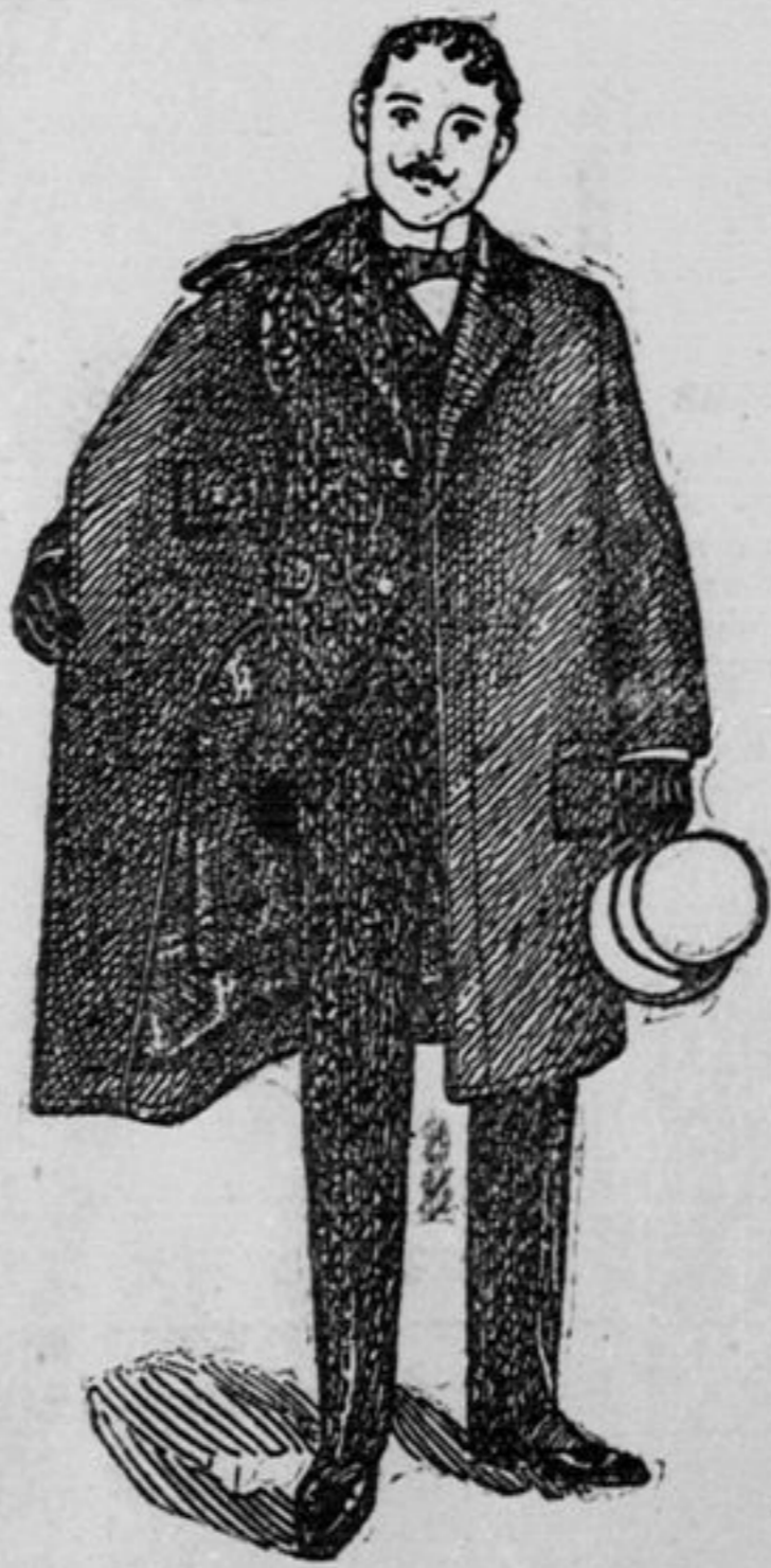
Men's Single and Double-Breasted Blue and Black Overcoats, 1899 shades and shapes, $3.95 to $8.00