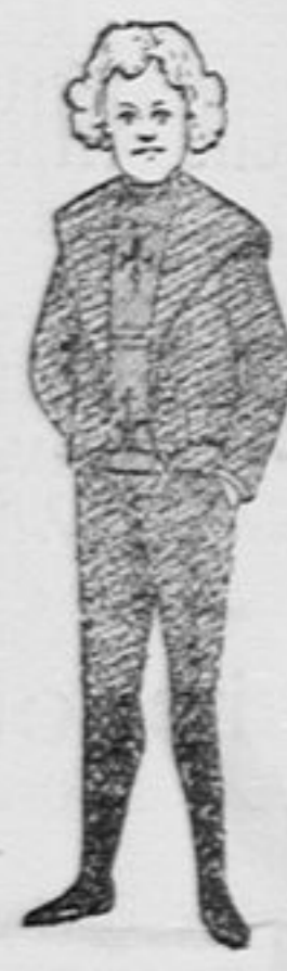
Boys' Brownie Suits, $1.45, $1.75 and $2.25