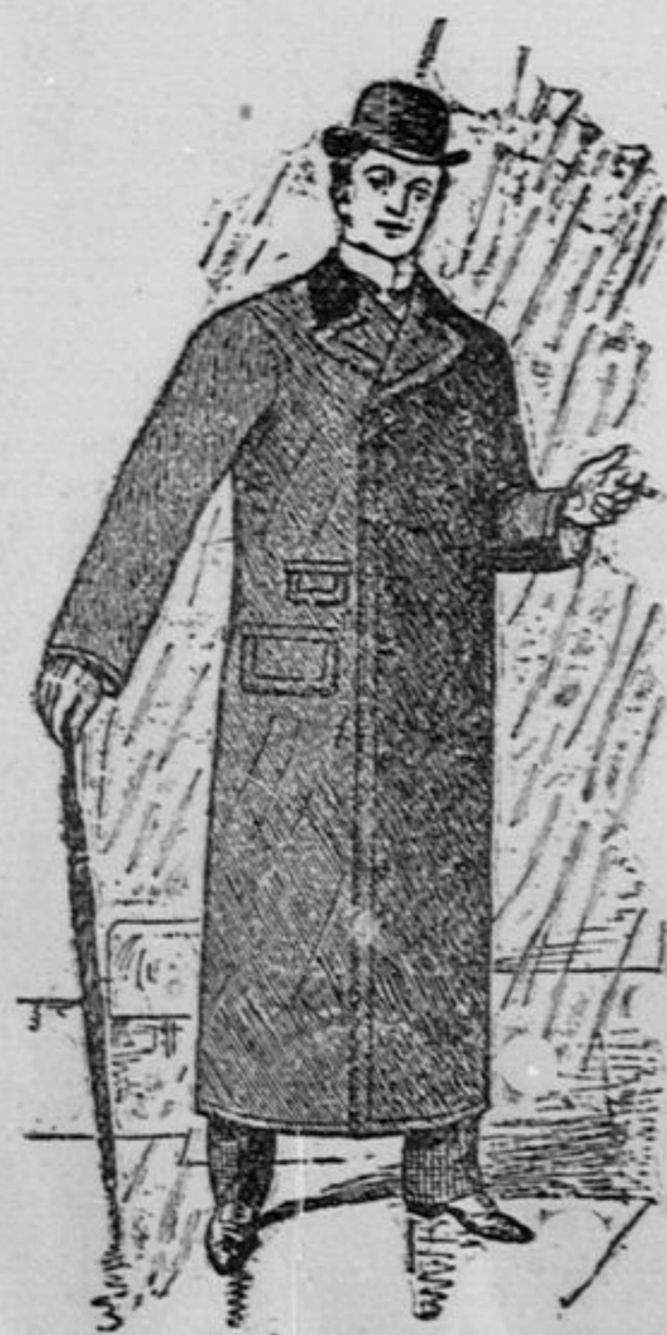
Men's Paramata Cloth Waterproof Coats, $2.25 to $6.50.