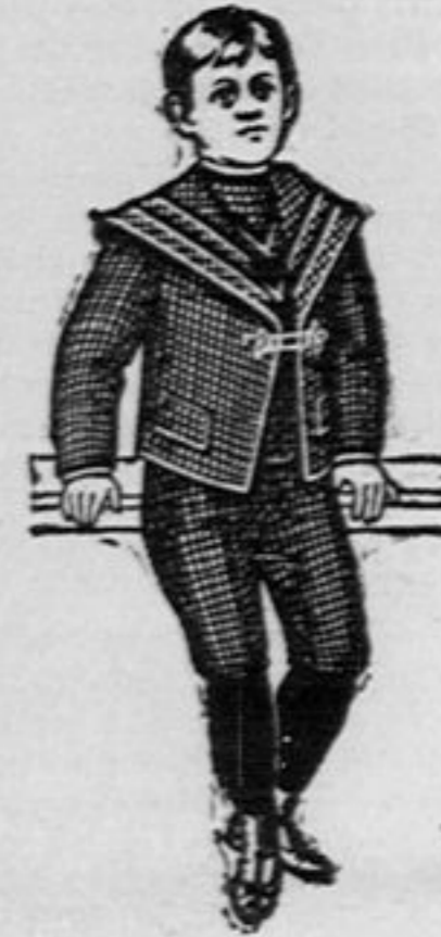
Boys' Scotch Pleated Tweed All-Wool $2.25