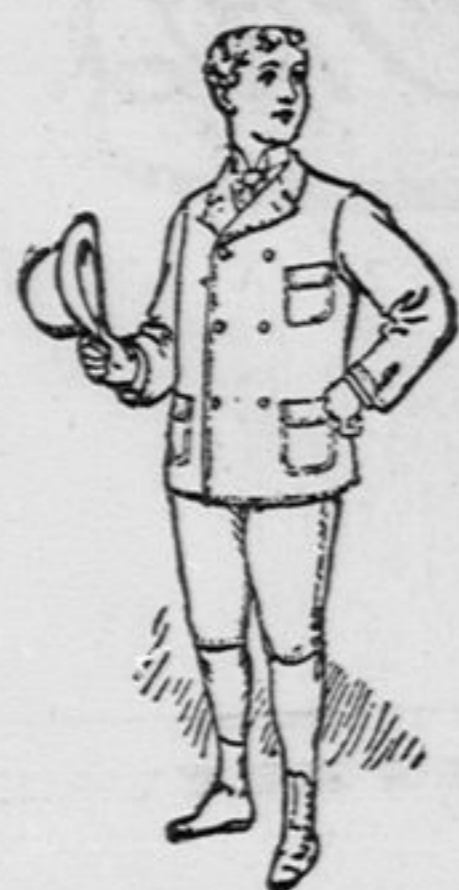
Heavy Canadian Tweed all-wool, double-breasted 3 piece, $2.50 to $3.75.