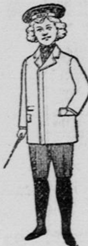
Boys' Overcoats, $1.45 to $3.50.