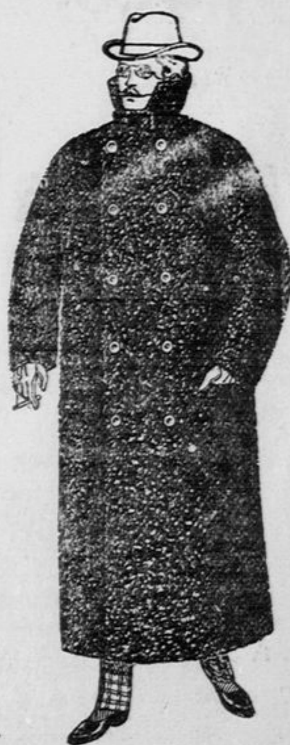
Men's Extra Heavy Frieze Ulsters. Double-Breasted, Storm Collar strap at back, well lined, $3.45 to $7.00.