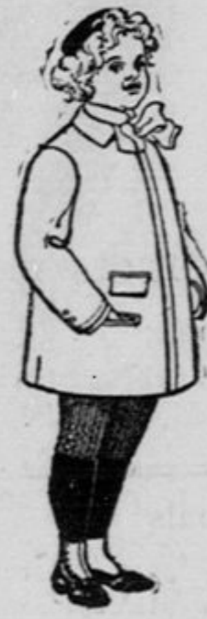
Boys' Reefers, 95c, $1.25 to $2.75.