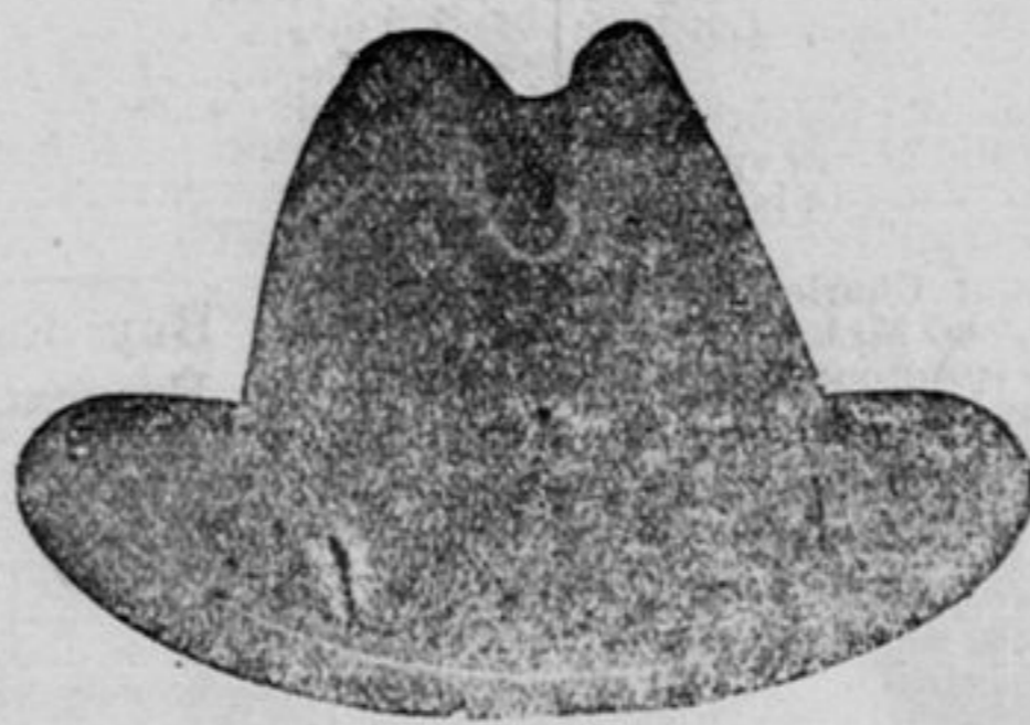
Latest in Hats and Caps