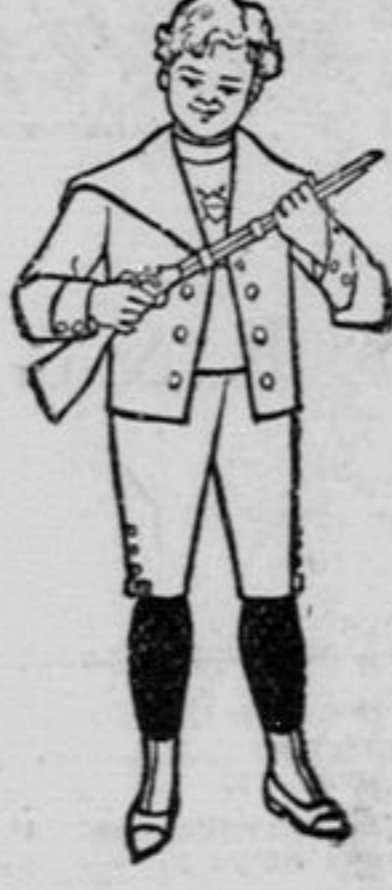
Fancy Pleated All-Wool Canadian Tweed Suits, $2.25.