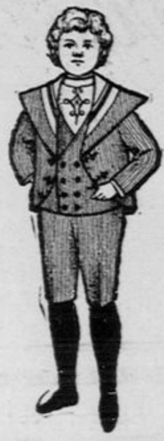
Boys' Fauntleroy Suits in fine Clay Worsteds, Velvets or Heather Mixtures, $3.50 to $5.00.