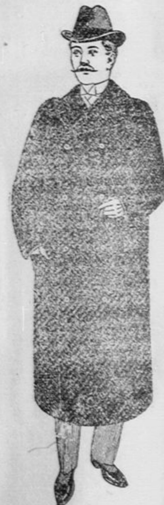
Men's Ulsters, made up in Irish Frieze, with Fancy Tweed Lining, made up and finished in best trade, $7 to $10.

Wishing our Friends A Merry Christmas and A Happy New Year