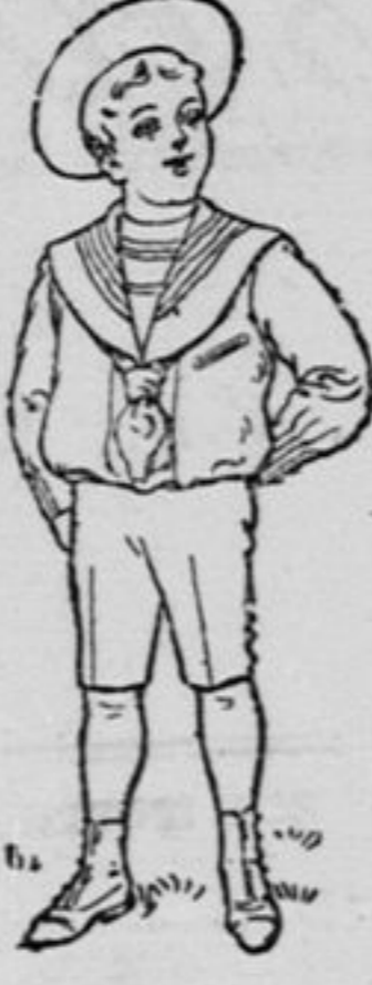
Boys' Heavy All-Wool Blouse Suits, $1.95 to $3.50.