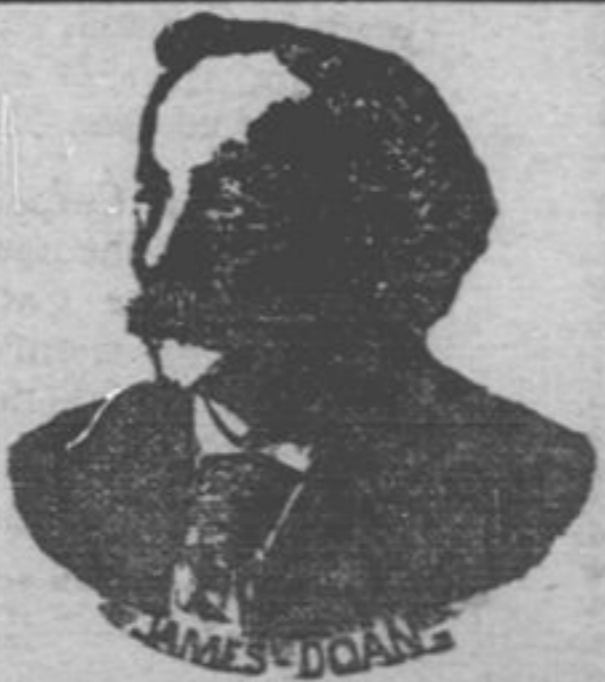
The Originator of