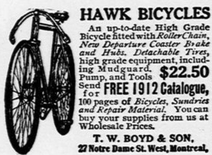
HAWK BICYCLES An up-to-date High Grade bicycle with Roller Chain, New DeLuxe Coaster Brake and Hub.

W. D. Staples, M.P., Used to Play the Game in Lindsay. Win if you can, lose if you must; but learn to take your whippings without a whimper.