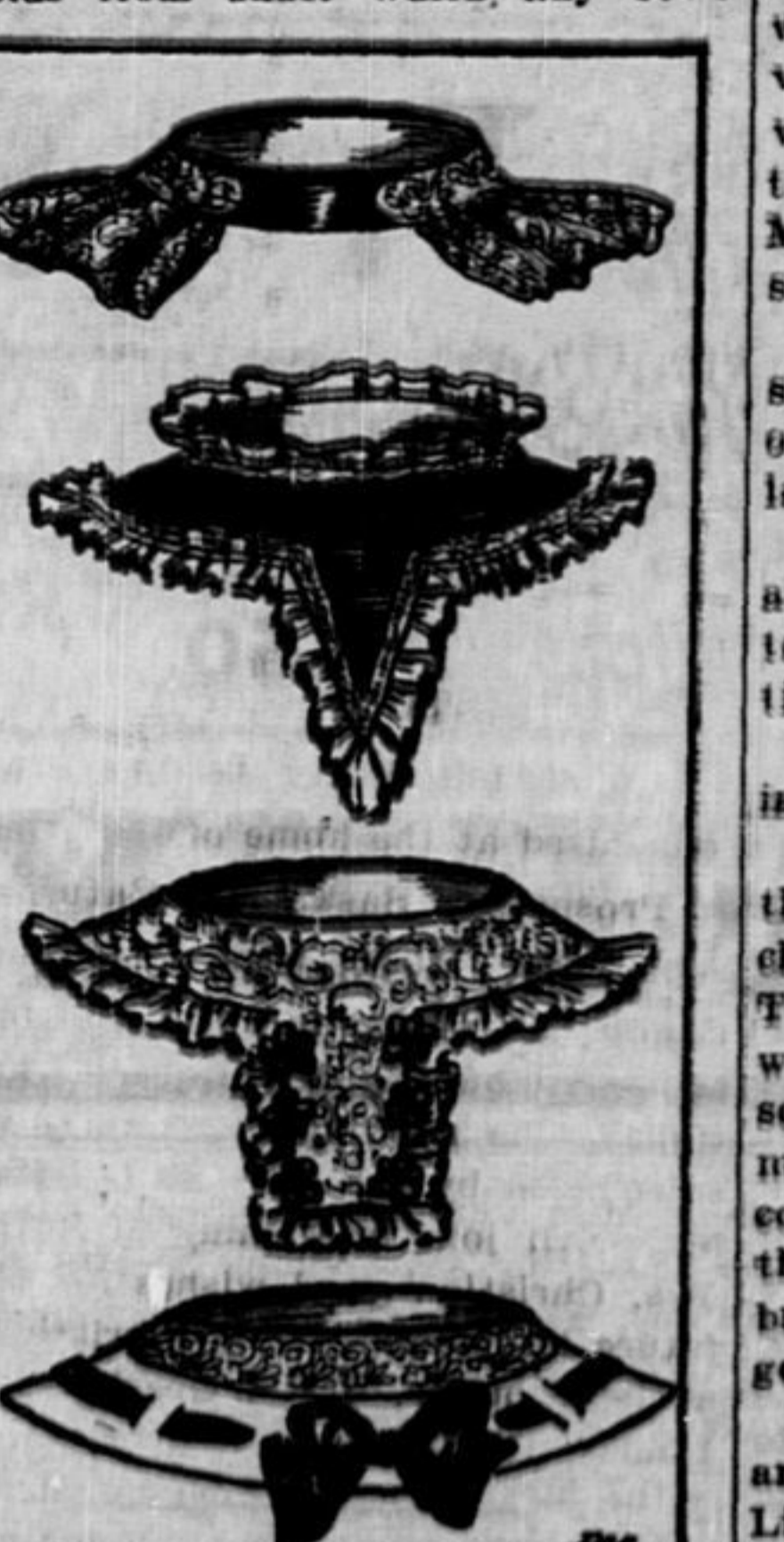
NECKWEAR WITH TOUCHES OF BLACK.

Black satin is used to cover button molds from under which tiny bows