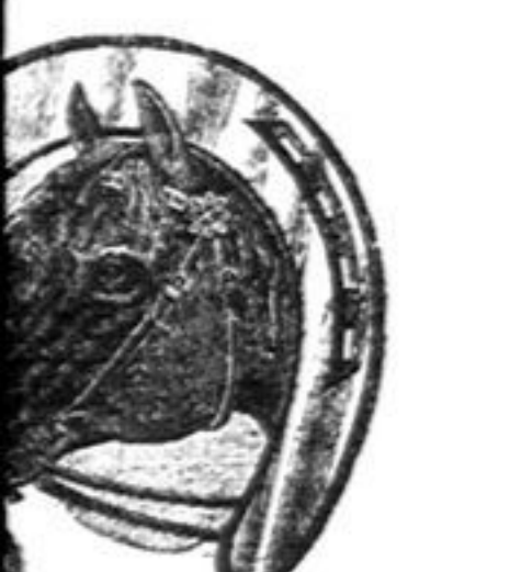
OCT. 3rd, 1908

stags, 2 and 3 years... all classes in lot... sold with-... road horse by John R... 100 lbs., first-class... 1200 lbs., 8 years... lady can drive him... 5 years old, good... horse by Harold Hart-... road horse by Penville... 5 months old... at time of sale... 3 post... 1 Fleury... only used 2... pair hobbles, 5... 1 rug... complete, etc... new... dozen cans... 2 new... Terms as