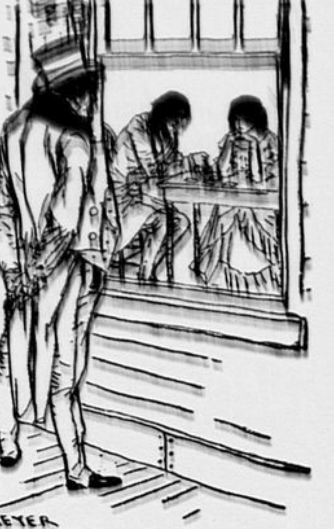
HE DISCOVERED KIRBY SEATED AT THE CARD TABLE.

And Kirby, looking through the window, he contemplated Kirby and the car made indignantly facing with the postscript and retreating away the time with Adele as it occurred in the peace and happiness of his own home. Such indifference was maddening, inestimable, and the old gambler, with a faint impression, decided that the moment Adele had gone he would say a last warning to his partner, and if it was still intended he would then think of his own safety and, however difficult it would prove, have to try to get to the safe.