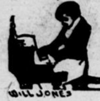
He Played in the Garret at Night

Every mother knows, or should know, the danger her baby runs during the hot summer months. Summer complaints come quickly and develop so rapidly that often before the mother realizes her baby is ill, he is beyond all help. Every mother of small children should keep a box of Baby's Own Tablets in the house. A tablet now and then will keep baby's bowels working regularly and his little stomach sweet—this is the secret of keeping baby healthy and of warding off cholera, infantum, diarrhoea, dysentery and all other dreaded summer complaints. The Tablets are guaranteed free from all injurious drugs and may be given to the newborn babe with perfect safety. They are sold by all medicine dealers or by mail at 25 cents a box from The Dr. Williams' Medicine Co., Brockville, Ontario.