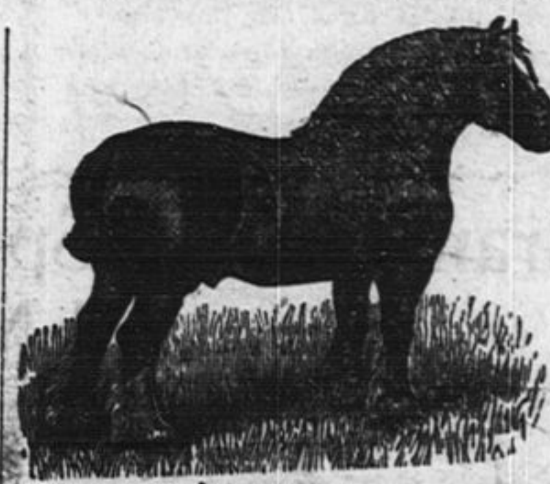
The Thoroughbred Clydesdale

When the new cement dam is completed a coffer dam will be built so as to have the water run over the cement dam, while the new locks are being constructed. This coffer dam will be built from near Flavell's mill to the other side of the bridge.