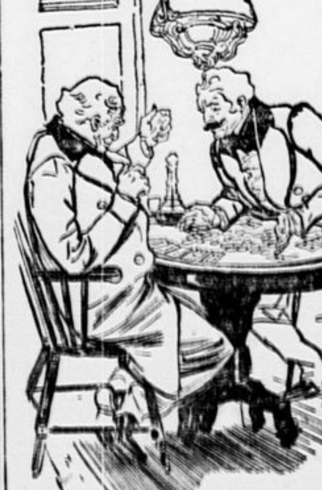
SATRIBO GLEAM PICKERED IN MOREAU'S BLACK EYE

"Draw to an inside straight and filled it, by gad!" he cried excitedly. "There's the turn in the tide, Colan! It rarely ever goes back on me. That's what I've been waiting for."