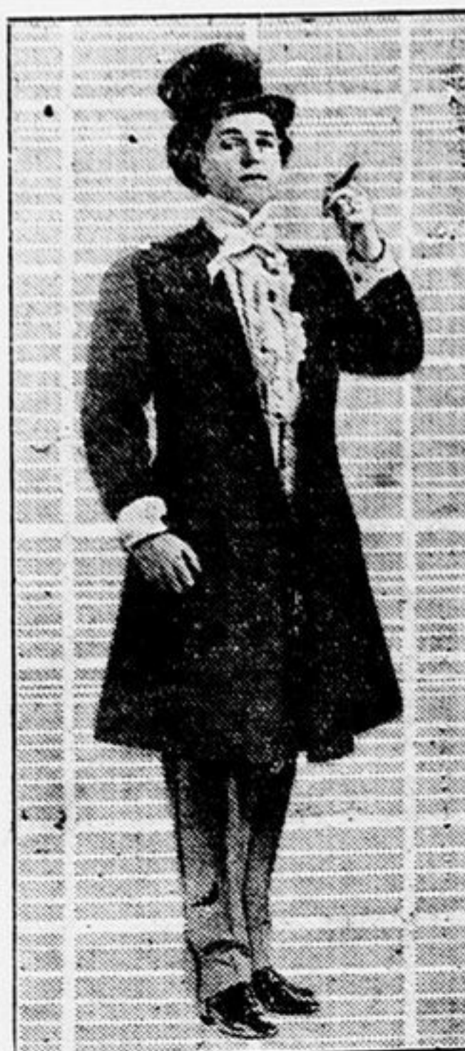
CAMEO KIRBY FAILED A DEBONAIRE AND NAUGHTY ATMOSPHERE