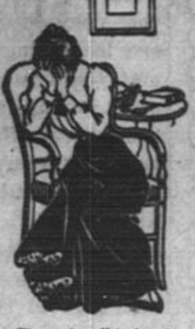
These terrible headaches permanently banished by Dr. Morse's Indian Root Pills.

Sick headaches are not merely afflictions to be borne as patiently as possible—they are danger signals. They never come unless the digestive system is out of order, and their regular recurrence is proof positive of serious trouble and a warning that should be heeded promptly. Sick headaches are caused by Indigestion, Bilioousness or Constipation, and no amount of "headache powders" will do more than temporarily relieve them. The only way to get rid of them entirely is to cure the Constipation or Indigestion that is causing them, and nothing will do this quicker or more effectively than Dr. Morse's Indian Root Pills . Dr. Morse's Indian Root Pills are purely vegetable in character, and are free from any harmful drug. For over fifty years they have been in constant use in Canada, and have proved most effective in regulating the bowels, aiding digestion, banishing sick headaches and restoring vigorous health. Dr. Morse's Indian Root Pills have stood the test for over fifty years, 25c. at all dealers. W. H. Comstock Co., Ltd., Brockville, Ont. 7