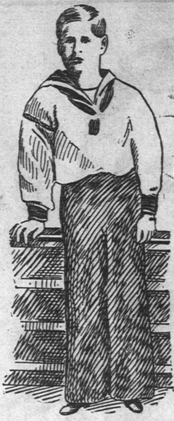
THE NEXT KING. (Edward, duke of Cornwall and York.)

manifested a decided inclination for military life and is considered precocious beyond his years. POPULAR ALWAYS.