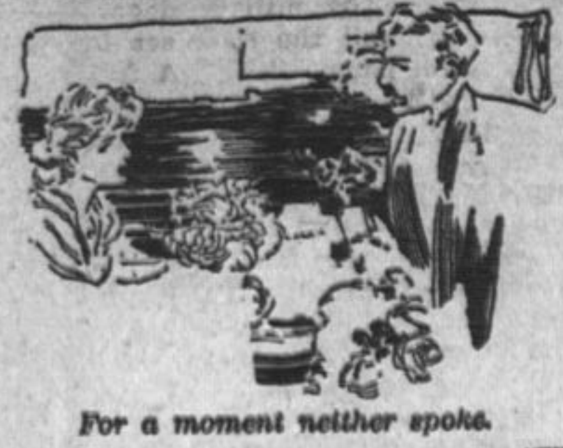
For a moment neither spoke.

he stepped forward, and his firm hand closed over the slim hand offered. For a moment neither spoke. She could not. He dared not. Then Drina caught his hands, and Eileen's loosened in his clasp and fell