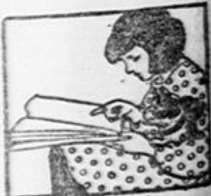
"Look at These Letters, Tommy"

when you take FOR BREAKFAST! will there is strength beverage it is perfect.