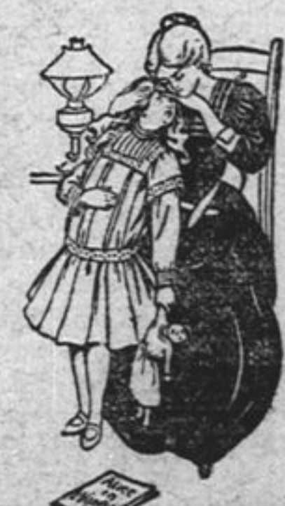
Dr. Morse's Indian Root Pills would make her healthy and happy.

Made by W. H. Comstock Co., Ltd., Brockville, Ont., and sold by all dealers at 25c. a box.