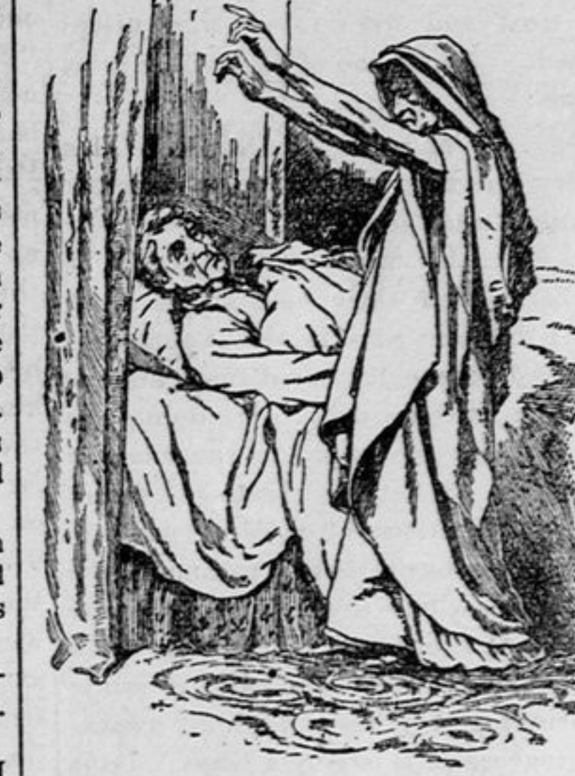
"I have been biding my time."

CHAPTER XIII. "MOTHER" SPILLMAN SPEAKS OUT AT LAST. Notwithstanding its capacity in the matter of mote magnifying and the building up of substantial charges from straws and wisps, Mandeville had a heart, and when it was known that Lawyer Matthews had actually taken to his bed and that Dr. Govan looked very grave when questioned about his patient's chances for recovery this heart swelled with a great pity for Olivia's prospective desolation, with the result that she was overwhelmed with neighborly offers of help and sympathy. Touching this widespread demonstration, she said to Miss Malvina, with shining, grateful eyes: "I always knew papa deserved to be revered by his neighbors, and it makes me so proud to be assured of the estimation he is held in. But I don't think he would like any of them at his bedside. He told me so. I think Reuben and I can manage the case. He is not very sick, you know. It is just a nervous attack. He has been in a dreadfully nervous condition ever since the fire. He was so frightened for me that night, you know." To which Miss Malvina answered "No, of course," and then "Yes, of course," vaguely trying to meet all requirements. She was thinking of how very ill Mr. Matthews really was and of how entirely uncon-