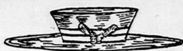
SAILOR at 50 Cents.