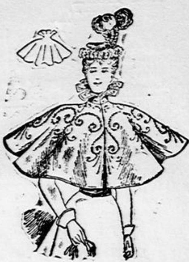
Capes at $3, $4 and $5.