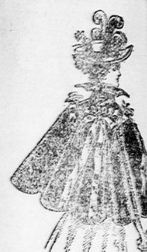
Capes $5, $6 and $7.50.

SPRING time and bright sunny days make one think of casting off winter garments. We've paved the way for your Spring Outfit and are convinced that no better or choicer stock of goods were ever shown in the Town of Lindsay. We've marked these goods at close selling prices. We want to see every doars worth of them, and to do this we must sell them cheap. If you study this nest of eggs you'll find that we sell the best class of Dry Goods as cheap as most stores sell shoddy for.