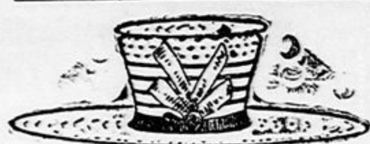
SAILOR at $1.25.