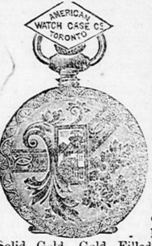
Solid Gold, Gold Filled, Silver and Nickel