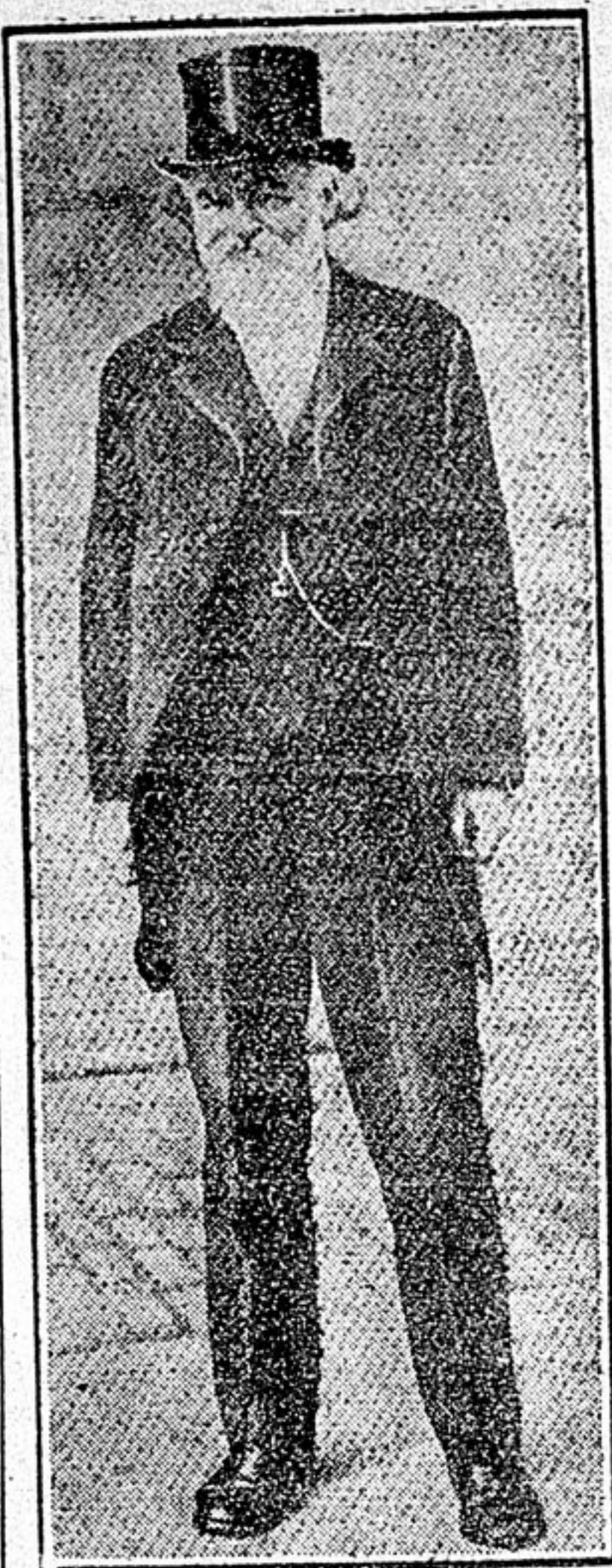
Sir Oliver Lodge,

Slow forgiveness is little better than no forgiveness.