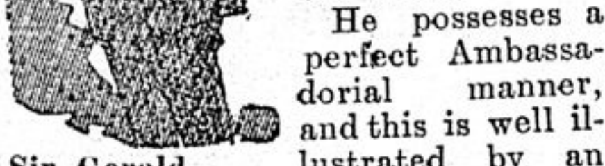
Sir Gerald Lowther.

Sir Gerald Lowther, the British Ambassador at Constantinople, has been undergoing a very anxious time during the past twelve months. He is one of Britain's most experienced diplomats, and has served at Washington, St. Petersburg, Madrid, Paris, Tangier, and other parts of the world.