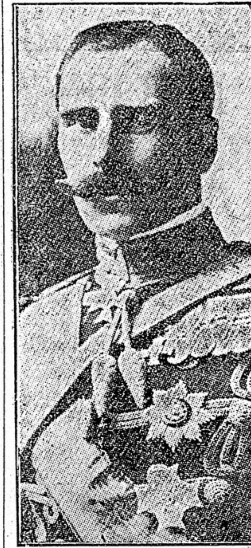
Prince Alexander of Teck.

Prince Alexander served in the 7th Hussars, and saw war service