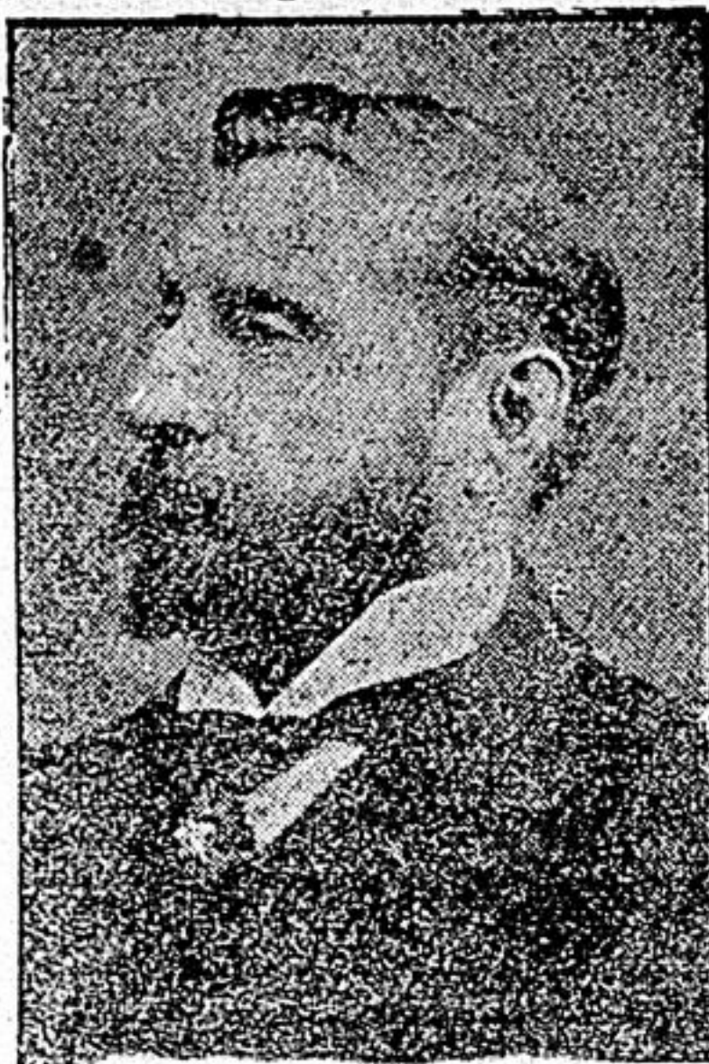
Mr. H. Rider Haggard.

Mr. Rider Haggard tells a good story about the premature publication of an obituary notice of himself. Hearing that a ballet based on "She" was to be produced in Hungary, he wrote asking for programmes and photographs. A reply came that the manager was shocked at the request, for he had believed the illustrious Herr Author to be dead. Long obituaries had appeared in the Hungarian journals. Mr.