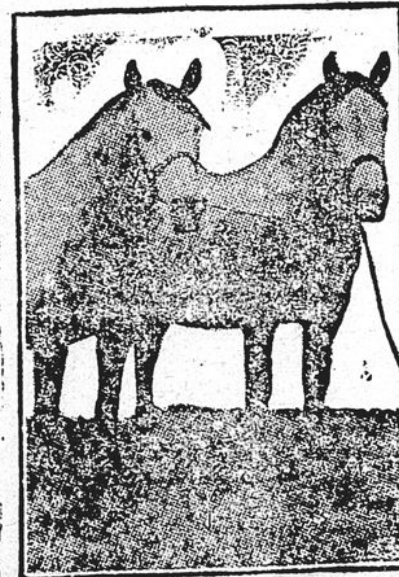
A FINE TEAM OF PERCHERONS.

The modern Percheron stands sixteen hands high and over, weighs