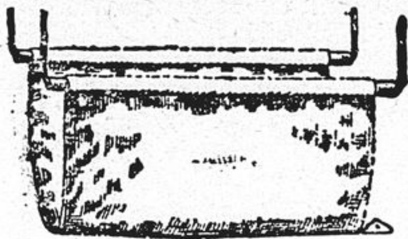
FOR INJURED COLTS.

"For the cloth part I secured a large cottonseed meal sack wide enough to support the entire undersurface of the colt's body. The ends of this sack I stitched securely over ordinary one