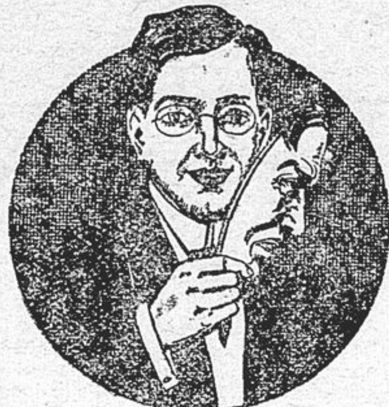
"For this Relief Much Thanks."

A. G. HULL & SON, ST. CATHERINES, ONTARIO, MENTION THIS PAPER.