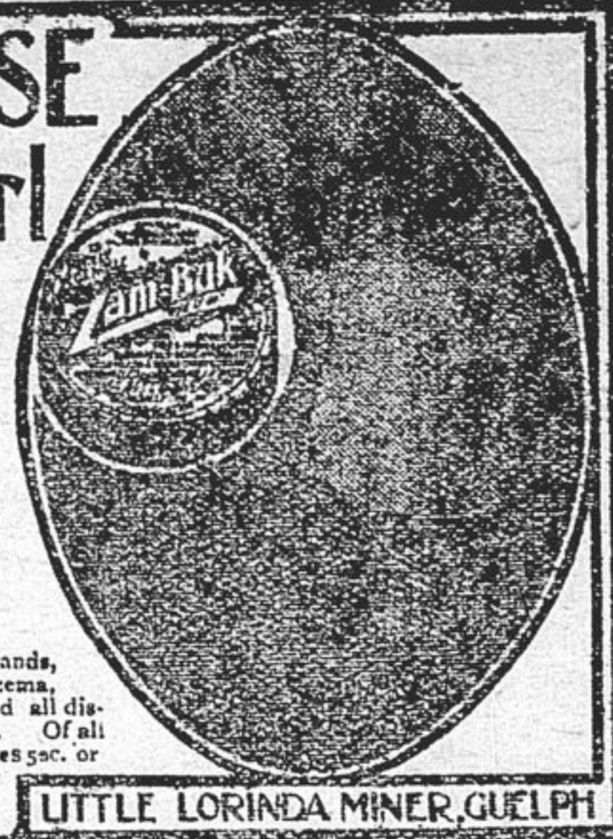
LITTLE LORINDA MINER, GUELPH