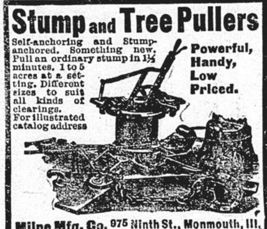
Self-anchoring and Stump-anchored. Something new. Pulls an ordinary stump in 15 minutes. 1 to 5 acres at a setting. Different sizes to suit all kinds of clearings. For illustrated catalog address Milne Mfg. Co. 975 Ninth St., Monmouth, Ill.

The sakais, or tree dwellers, of the Malay Peninsula build their houses in forked trees a dozen feet above ground, and reach them by means of bamboo ladders, which they draw up when safely housed out of harm's way. The house itself is a rude kind of shack, made of bamboo, and the flooring is lashed together piece by piece and bound securely to the tree limbs by rattan. These curious people are rather small and lighter in complexion than the Malays, though much uglier. They have no form of religion at all—not even idols—no written language and speak a corrupt form of Malay.