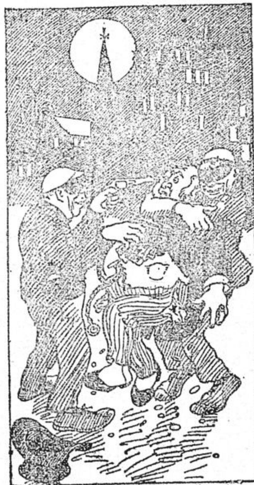
FINANCIAL TERM. "Squeezed for Money."

Mrs. Long—"I'm glad to hear it. I expect she saw she was making herself ridiculous."