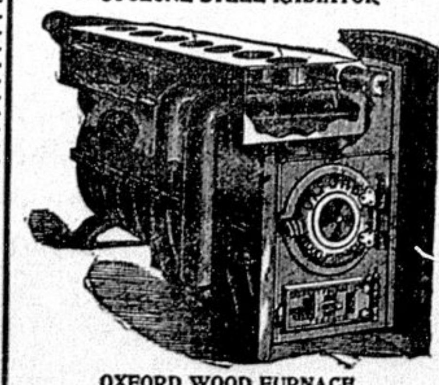
OXFORD WOOD FURNACE