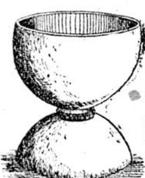
COCOANUT SHELL FLOWER-POT.

The accompanying illustration shows a very simple way of making an odd little flowerpot to set among the orthodox