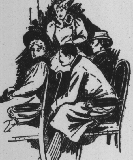
The Empress of Japan.

If you lack a jardiniere in which to put a blossoming plant that is to be placed on the dinner table or in other conspicuous places, you can always make it fine enough for the occasion by wrapping the plant crock in crepe tissue paper and tying it with a satin ribbon.