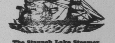
The Steamship Larder.

Proprietors. Wholesale and retail dealers in all kinds of Lumber and Wood.