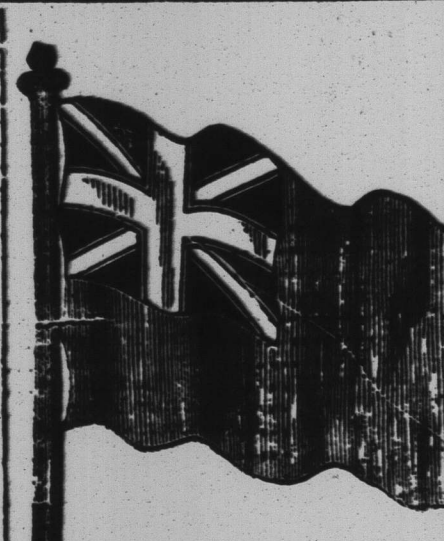
The flag that's hoisted a thousand years The battle and the breeze.