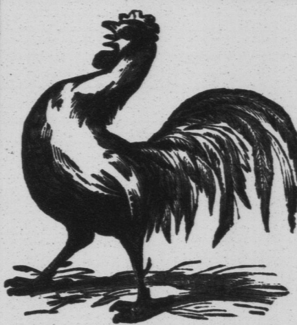
THE SYLVESTER Light Steel Binder VICTORIOUS! This success in field last season, and also at exhibition this year, is conclusive evidence of its being the Best Binder on Earth.