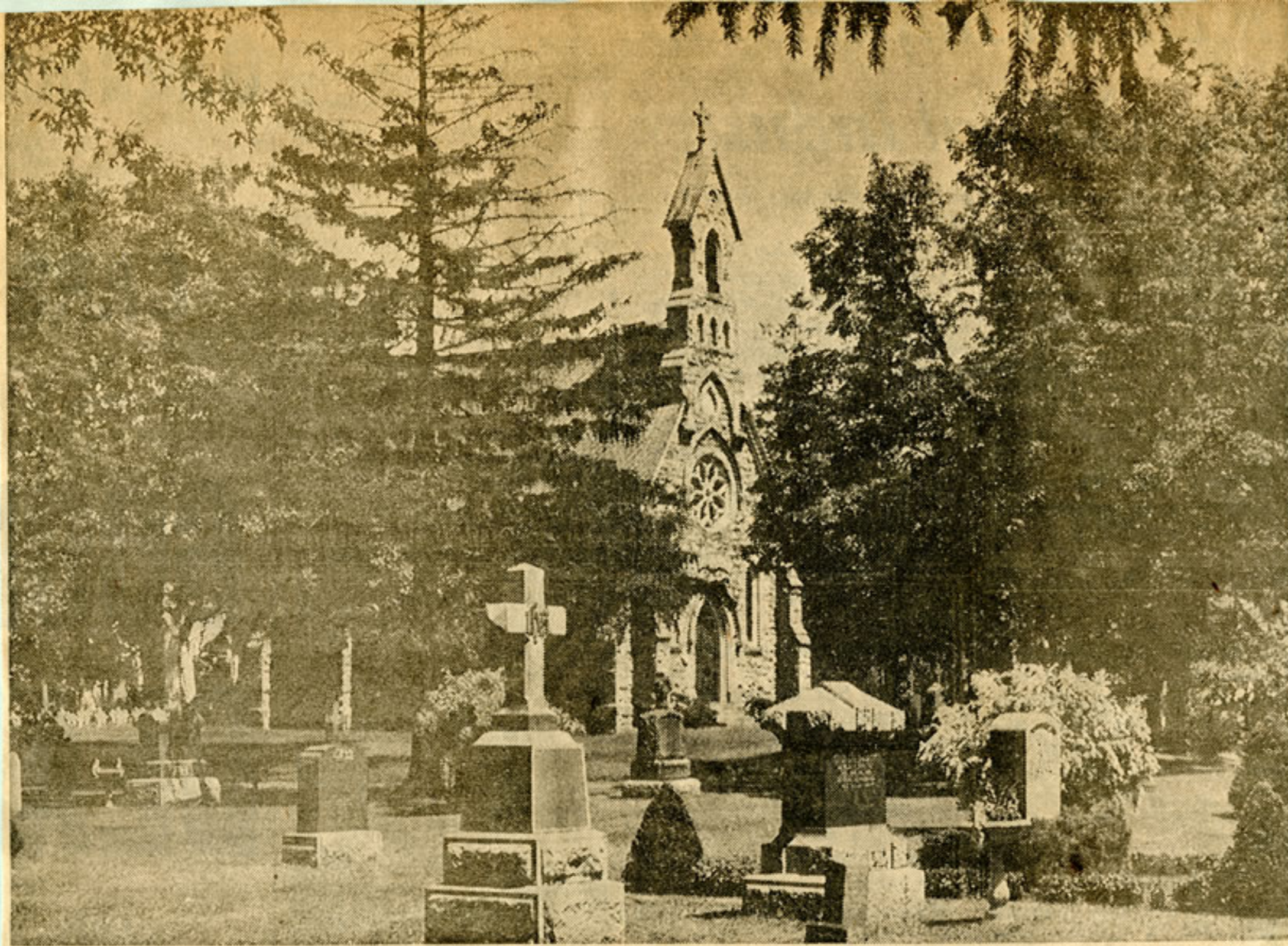
THE OLD . . . First Roman Catholic church in Aldershot was this burial chapel at Holy Sepulchre Cemetery. Masses were held here in this sylvan setting for four years prior to the opening of the new church.