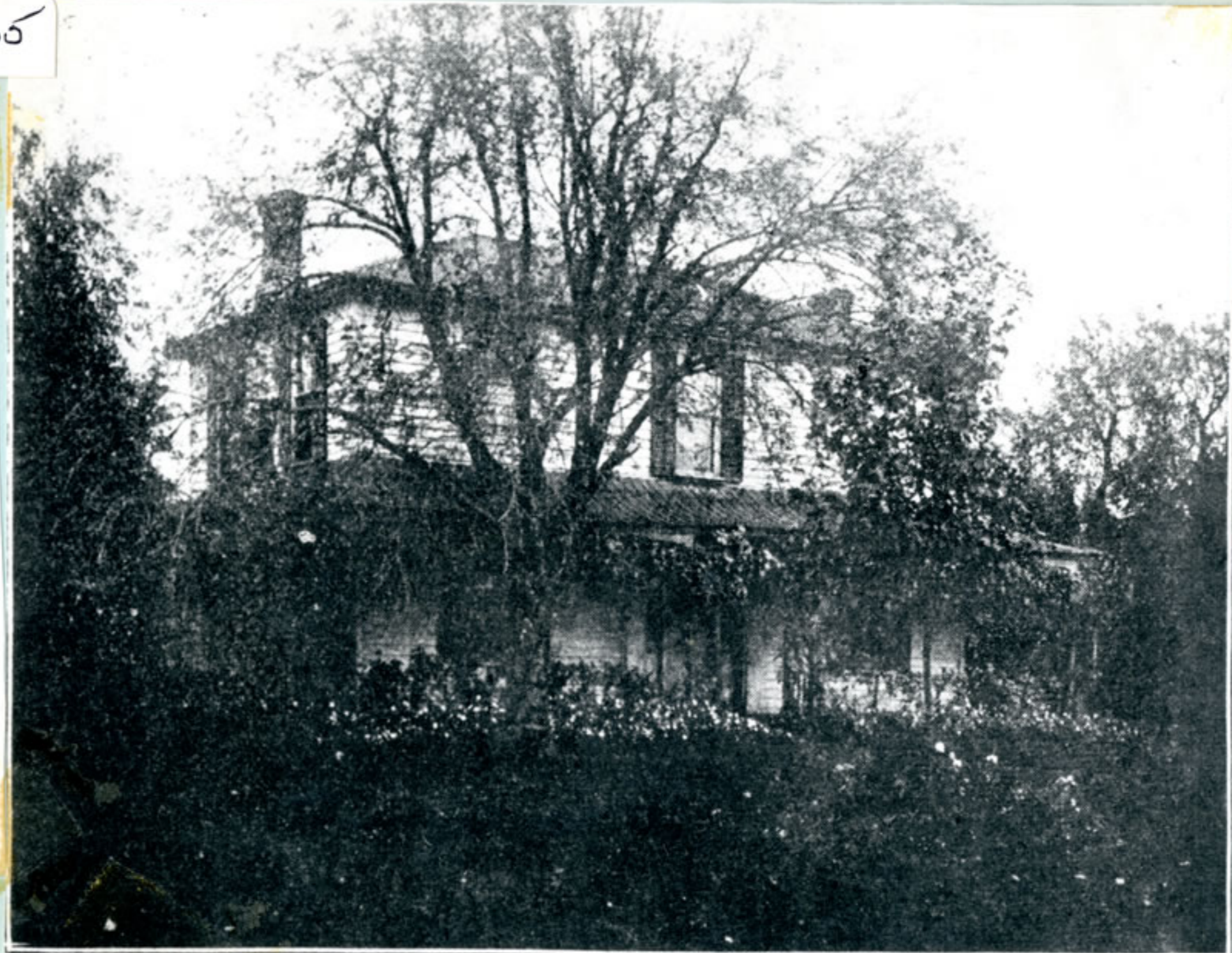
"MAPLEHURST," RESIDENCE OF GODWIN BROS., ALDERSHOT.