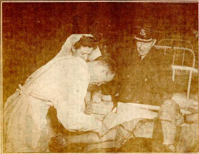
At a blood donor clinic, Trenton, between 1942 and '45.