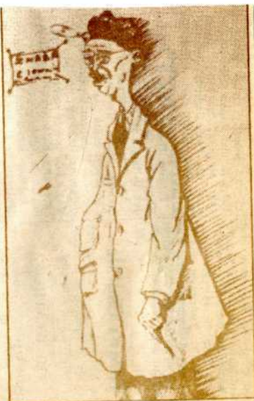
A caricature of the doctor.