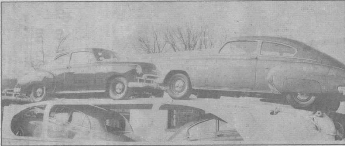
These are '49 Chevrolets ready to be sold at Weese Motors in Trenton.