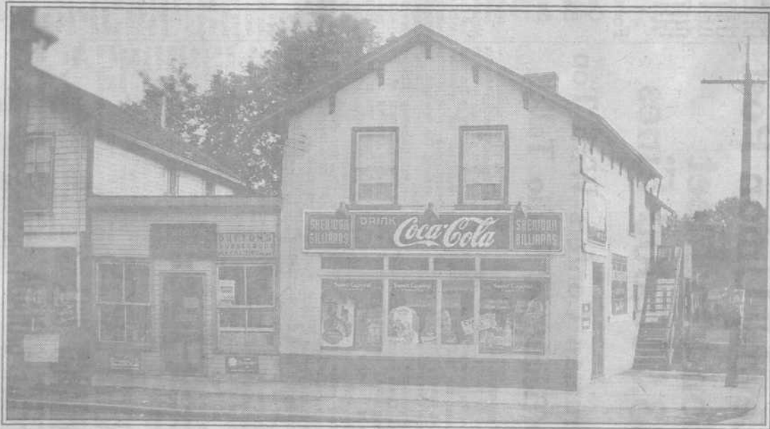
Sheridan Billiards at Bleeker and Station Streets, approximately 1946.