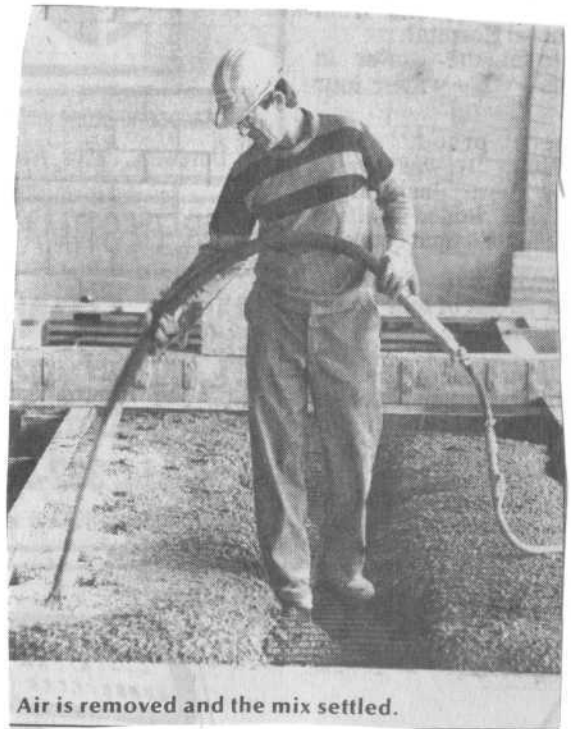
Air is removed and the mix settled.