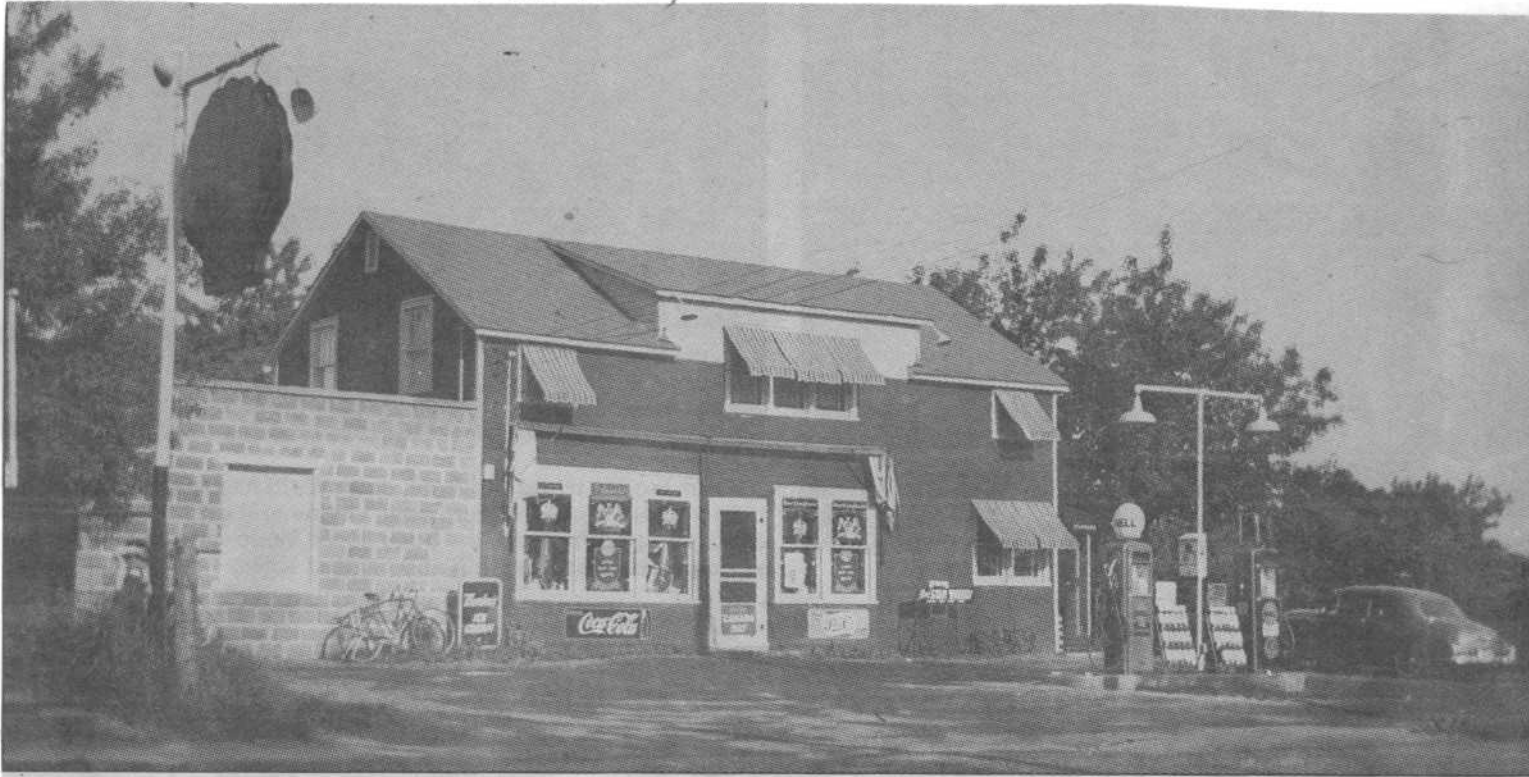
When Don and Phyllis Parks' added the service station to their store on Cannifton Road, gas was provided by Shell.

Intelligence, Remember When Nov. 27, 1995