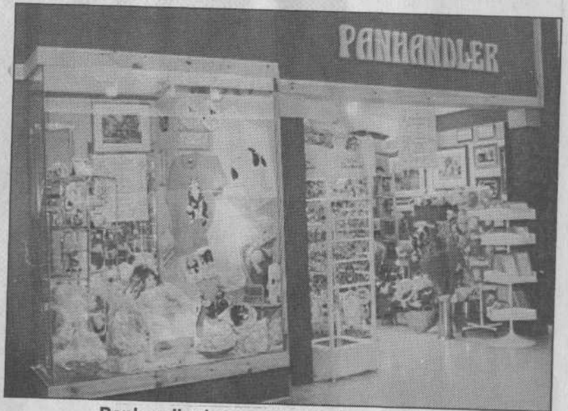
Panhandler has an ideal Quinte Mall location.