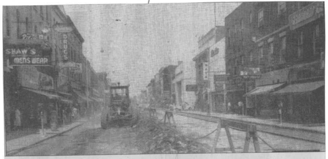
SUBMITTED PHOTOS The Metropolitan Store was located right opposite the Canadian Bank of Commerce in this picture of downtown Belleville in the 1950s. The store had been a downtown institution since it was first set up in 1929.