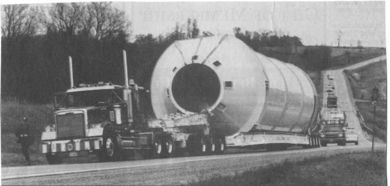
In 1997, McMullen hauled 12 huge silos - one of its biggest cargos - from Belleville to Perth. The move required the use of many isolated routes and a police escort along Highway 7.