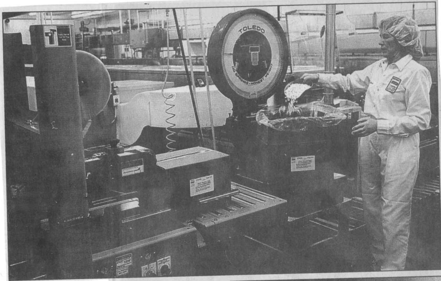
Above: Jane Travis packs baking flakes at one of the production lines at Lipton Monarch.