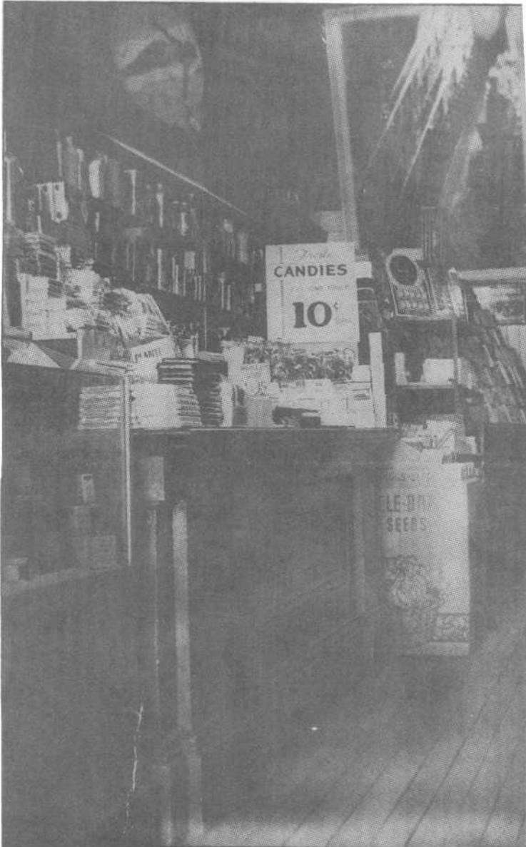
The interior of Geen's when it was as much a general store as it was a pharmacy.