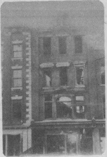
302 Front Street