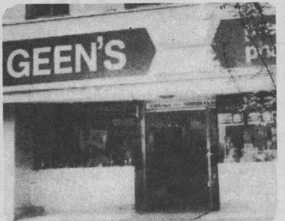
276 Front Street Present location, since 1941